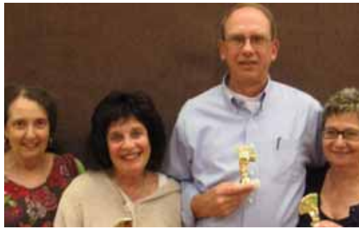
Gallery of winners from 2012 EMBA Memorial Day Sectional