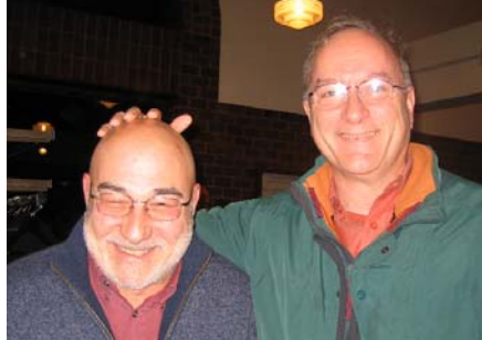
EMBA NATIONAL CHAMPIONS SPRING NABC 2009